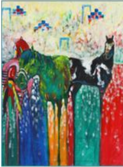
"When Lakotas Traveled on Them" Ivan Long (Oglala Lakota) Acrylic, 18 x 24 inches $2200