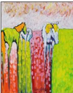
"Different Ponies" Ivan Long Oil, 16 x 20 inches $1000

Let your eyes and mind be twirled by Australian pointillism!